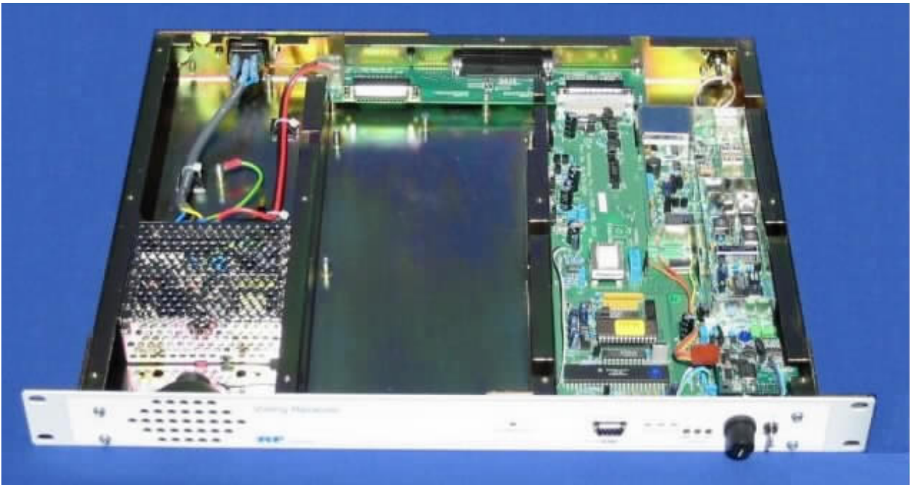
Transmitter space for repeater applications